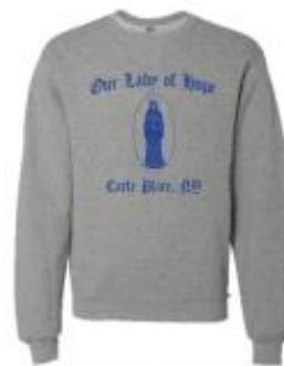
Grey Sweatshirt Small – 4X

Please complete Order Form Below and submit, along with payment, to office no later than May 10, 2025