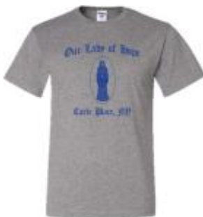
Grey T-Shirt Small – 4X