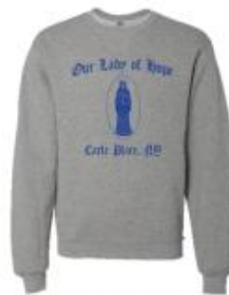
Grey Sweatshirt Small – 4X

Please complete Order Form Below and submit, along with payment, to office no later than May 10, 2025