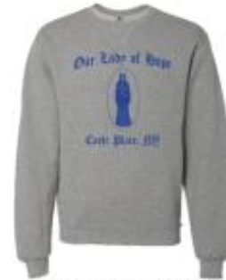
Grey Sweatshirt Small – 4X

Please complete Order Form Below and submit, along with payment, to office no later than May 10, 2025