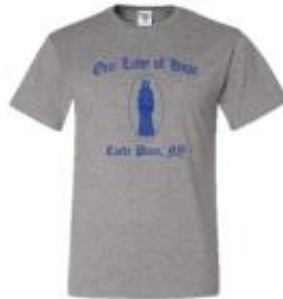
Grey T-Shirt Small – 4X