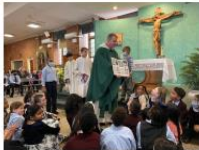
We kicked off the week with our Opening Mass on Sunday.

Catholic Schools Week is a joyful celebration of community, faith, and the gift of Catholic education! We've rounded up some of our favorite photos from the week to share with you: