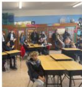
After Mass, we invited families to visit next year's classes for a preview.