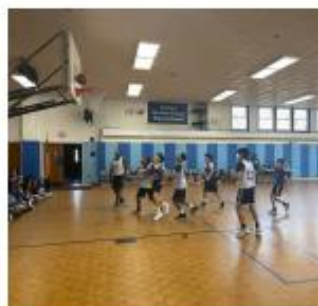
Our Pep Rally featured scrimmages with our Knights Basketball Team and Lady Knights Volleyball Team, as well as free throw challenges for everyone!