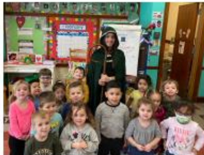
We celebrated Mass and had a visit from St. Brigid herself on her feast day.