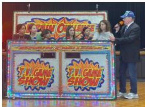
The Hollyrock Game Show is a Catholic Schools Week tradition. The Game Show combines Brain Challenge rounds and Physical Challenge rounds, and of course championship Simon SAYS. The kids of all ages go wild with excitement!