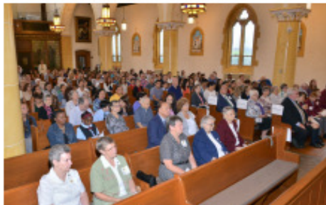
Several hundred students and their families were present, as well as past and present teachers, board members and alumni.

Celebrating 100 years of faith, family and knowledge!