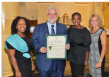
Many elected officials attended or sent representatives.