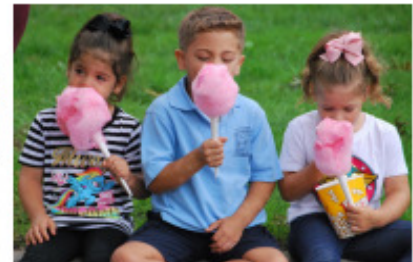
Once we got to school, we enjoyed burgers, hot dogs, cotton candy and popcorn. Activities included pony rides, a bouncy house, face painting and a giant slide!