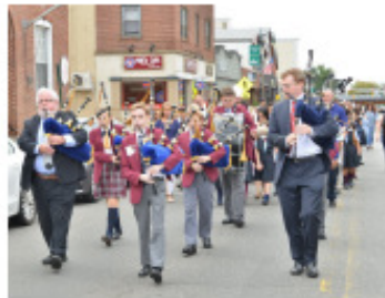
After Mass, we processed down Post Avenue to the school, led by the Kellenberg Memorial High School Bagpipe Club.