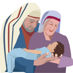
Simeon & Anna See Jesus

In the first reading, Sirach echoes God's mandate to honor our father and mother, for in doing so we honor God. In the second reading, Saint Paul instructs the Colossians to live in the spirit of Christ, loving one another and seeking peace. In the Gospel, Joseph and Mary present Jesus at the Temple for the ritual of purification. There they encounter the prophet Simeon and prophetess, Anna, who offer thanks to God for this long-awaited Savior and foretell of His coming reign of power.