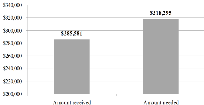
Collections Eight Months ended April 30, 2017

Please visit the Library, located in the front, right stairwell of the Church. If you have a question about your faith, you can find the answer in many of the library's titles. There are books on meditation and spiritual healing. The video collection contains lives of the saints and other religious subjects.